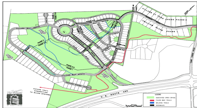
Figure 1. Study Site, Tom's Creek Village, Blacksburg, Virginia

systems that benefit the community by allowing for the use of smaller pipes, fewer manholes, and less reliance on minimum slopes. These systems create lower energy costs and prevent blockages that normally occur from solids settling in a collection system (Schein 2010).